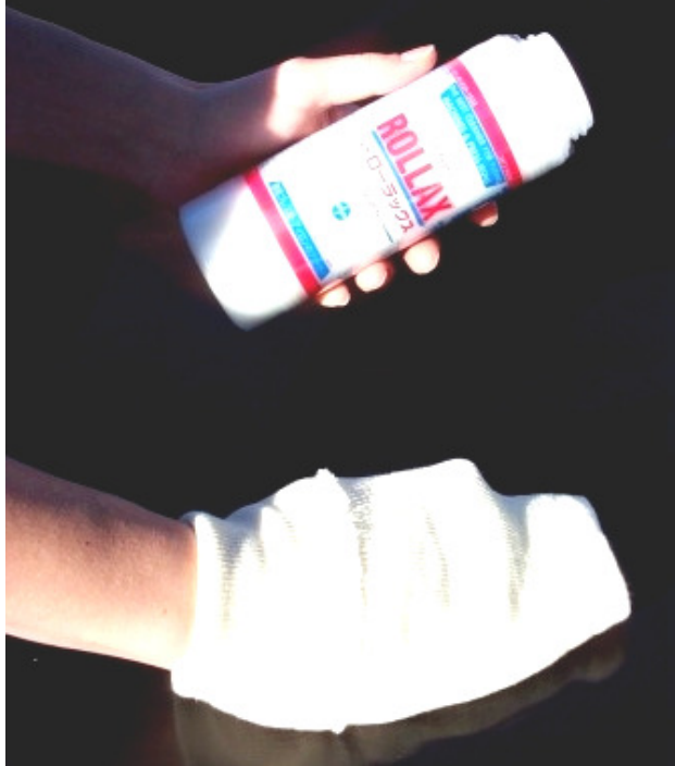
Rollax powder , 250-g-bottle art.no. 3812

removes adhesive residue, prevents from further sticking and preserves the operation surface of fusing presses, irons and transport belts of fusing machines made of PTFE coated glass fabric.